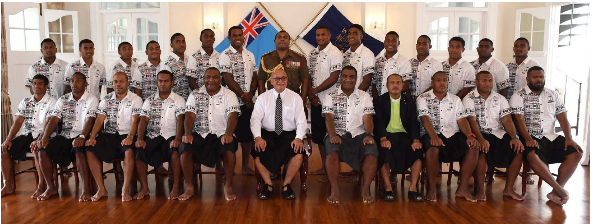
President Major General (Ret'd) Jioji Konrote with players and officials of the Fiji Under-20 Men's rugby team after presenting their itatau at the State House in Suva.