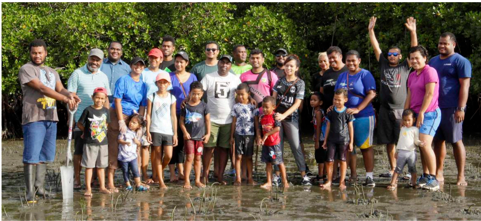
Staff members of Department of Information and Ministry of Forestry with their family after planting about 2000 mangrove seedlings along Nasese foreshore in Suva last week.