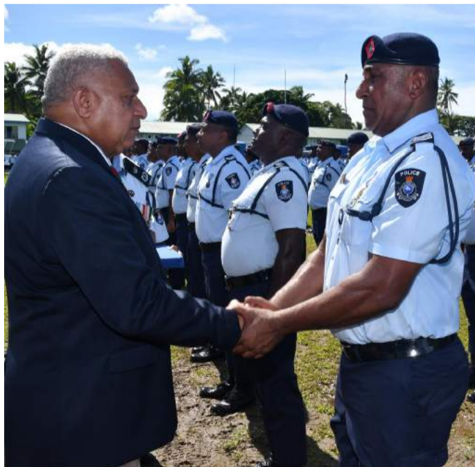
Prime Minister Voreqe Bainimarama at the medal presentation to Police Officers at Nasova, Suva.