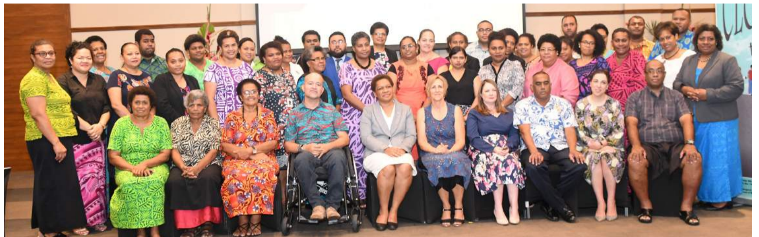
Minister for Women, Children and Poverty Alleviation Mereseini Vuniwaqa with participants at the opening of the Beijing Platform for Action +25 Review Forum at Grand Pacific Hotel.

"Fijian workers will now have access to employment and skills development opportunities through the Pacific Labour Scheme."