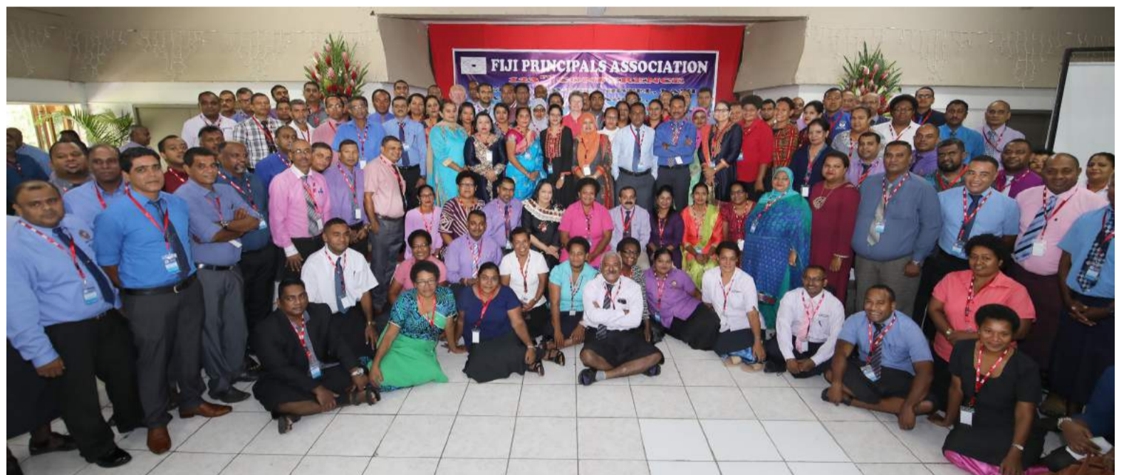
Minister for Education Rosy Akbar with more than 140 principals from various schools around the country during the 123rd Fiji Principals Association Conference.

With discussions and ideas expected to develop through the summit Minister Kumar is adamant to develop forward-looking policies to expand our development frontier and support the vision of Transforming Fiji.