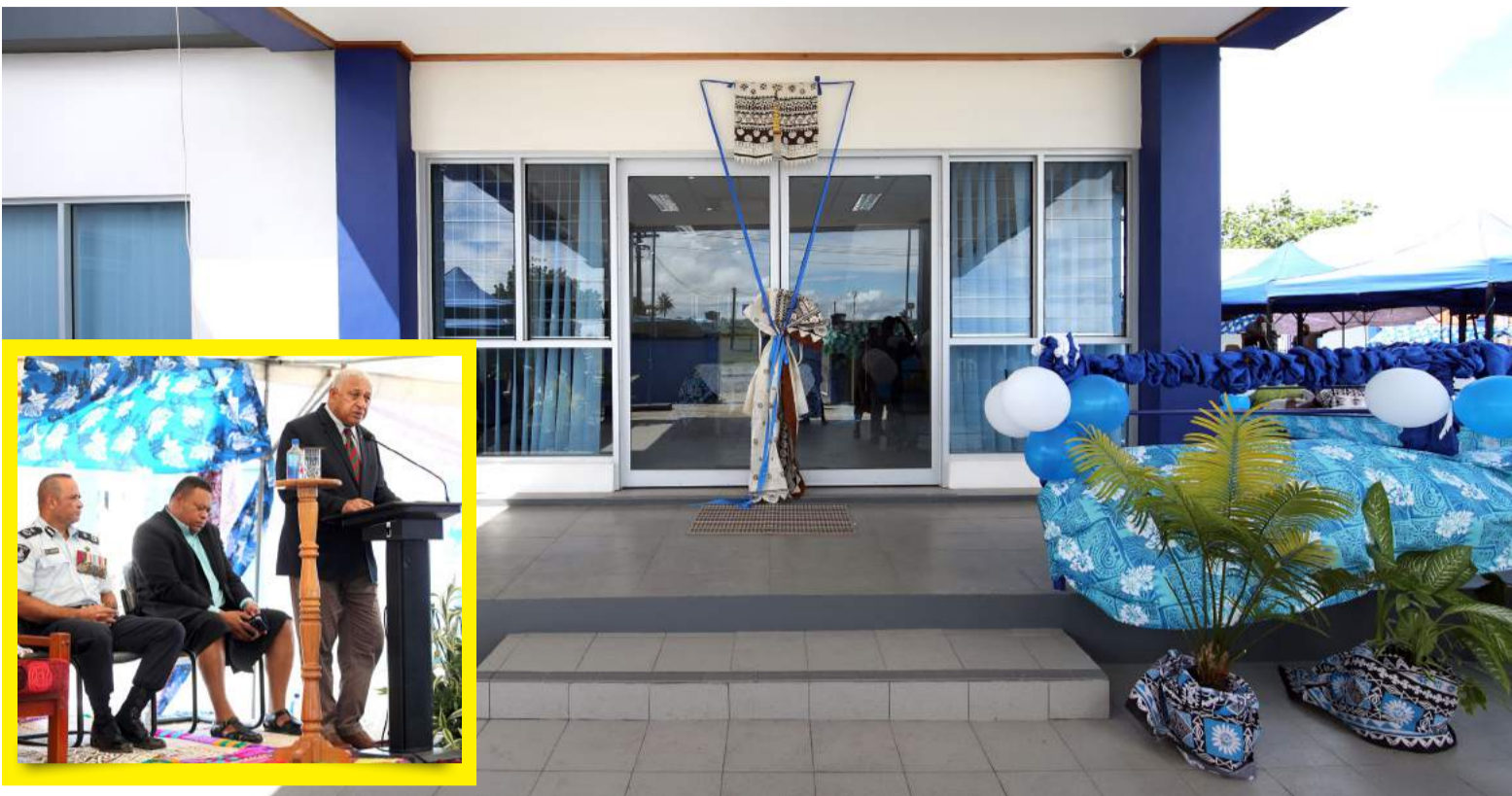
The new Valelevu Police Station that was opened by Prime Minister Voreqe Bainimarama (inset) last week.