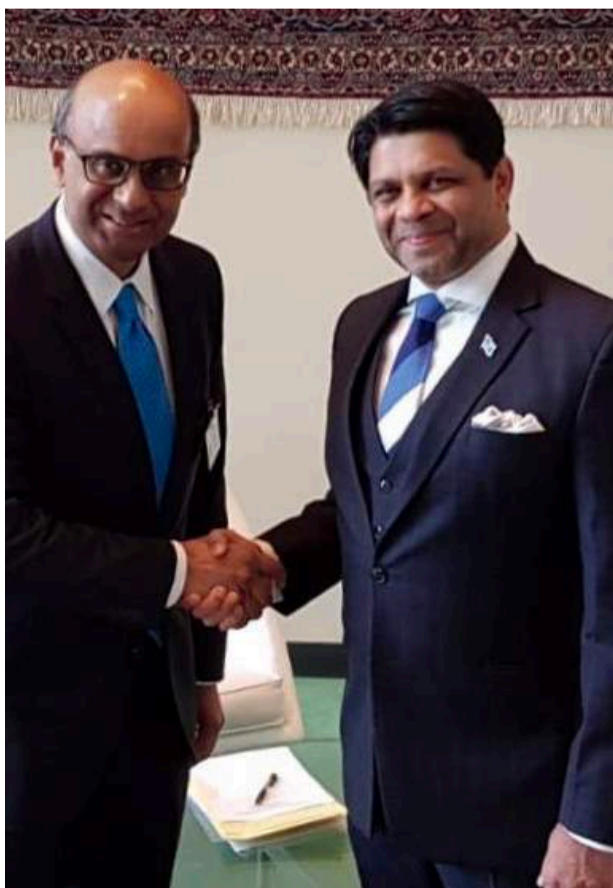
Attorney-General and Minister for Economy Aiyaz Sayed-Khaiyum with Singapore's Deputy Prime Minister and Co-ordinating Minister for Economic and Social Policies, Tharman Shanmugaratnam.