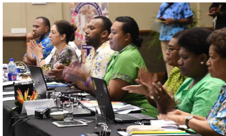
Participants at the Beijing Platform for Action +25 Review Forum at Grand Pacific Hotel.