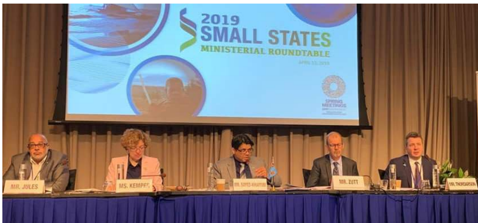
Attorney-General and Minister for Economy Aiyaz Sayed-Khaiyum (middle), chairs the Small States Ministerial Roundtable in the margins of World Bank Group (WB) and International Monetary Fund (IMF) Spring Meetings at Washington DC, United States of America.