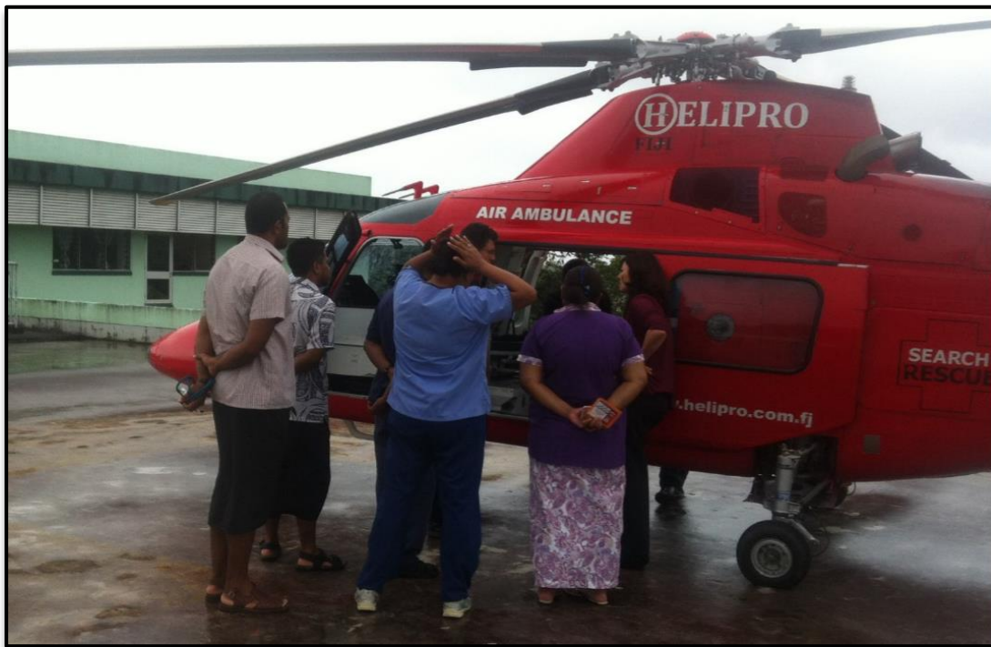
DQ-EMS delivering critically ill patient to the Colonial War Memorial Hospital Suva

Our Senior Emergency Medical & Rescue Team consists of a Medical Director, Senior Flight Nurse, Paramedic, Liaison Officer and highly trained ground staff ensuring the best possible patient outcomes. Helipro provides patient & family services in Fiji to ensure that there is always someone to assist. Helipro coordinates all aspects of patient recovery throughout the Fijian Islands and with its international partners, ensure patients are transported to overseas hospitals in the shortest possible time.